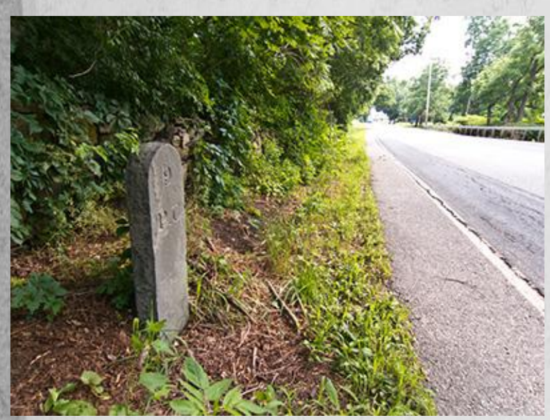
View to the north. July 2017.