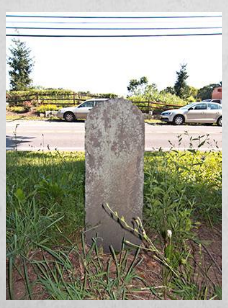
Back of stone. July 2017.