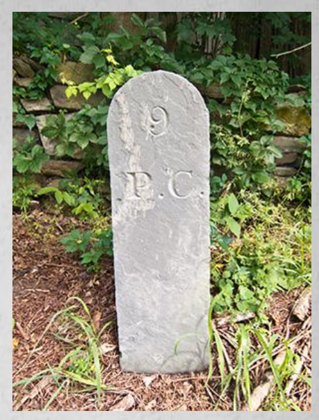
Front of stone. July 2017.