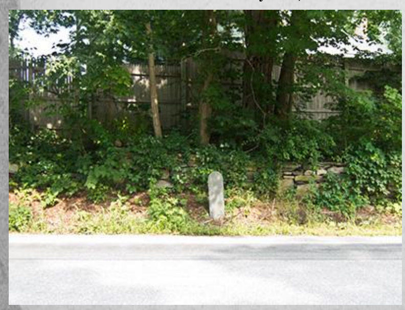
View of the stone from across the road. July 2017.