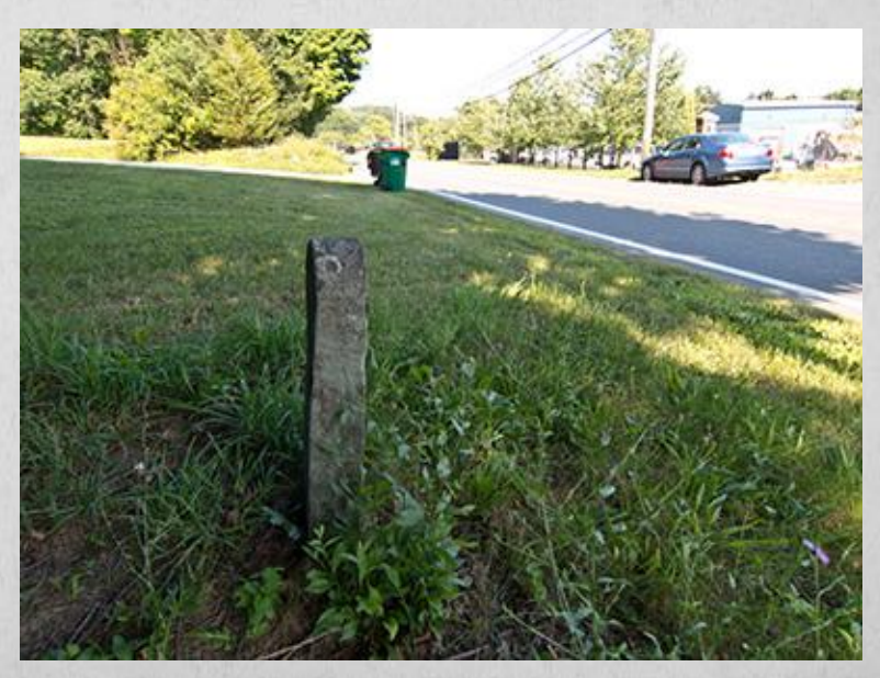
Looking north. July 2017.