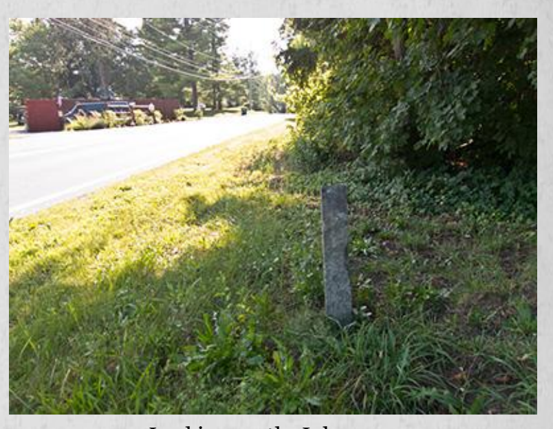
Looking south. July 2017.