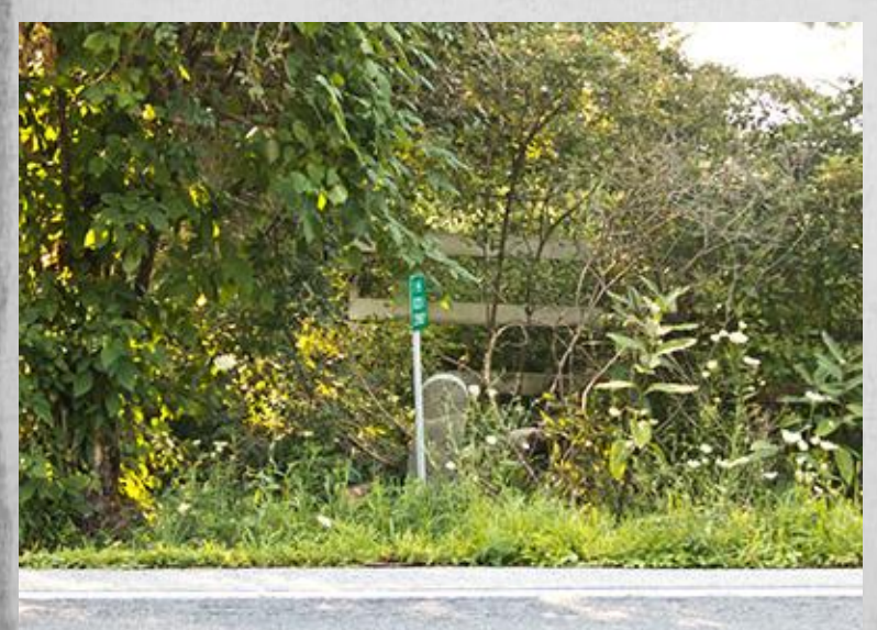
Front of stone, from across the road. July 2017.