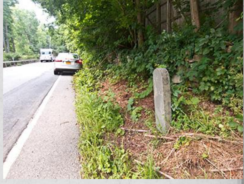
View to the south. July 2017.