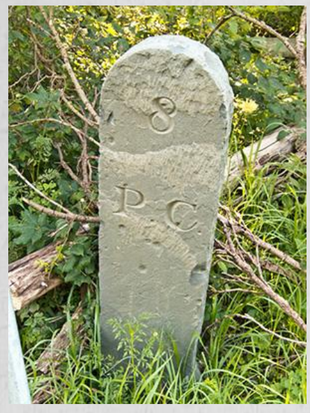
Front of stone. July 2017.