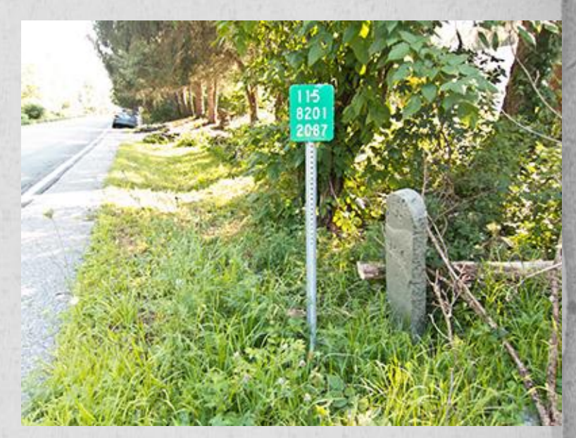
View to the south. July 2017.