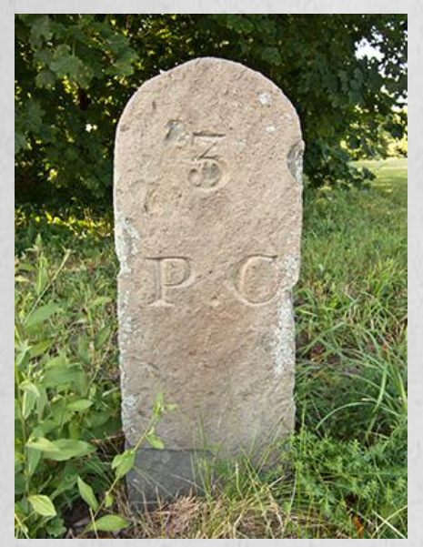
Front of stone. July 2017.

#1- My personal experience - default source unless otherwise noted