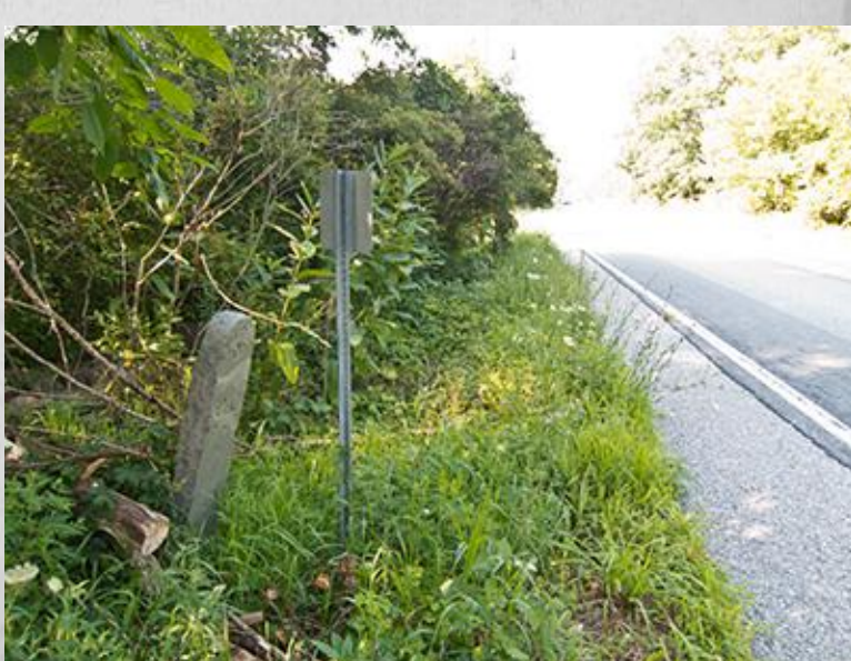
View to the north. July 2017.